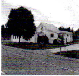
Gethsemane (OLA Main House)