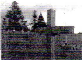
Stations of the Cross