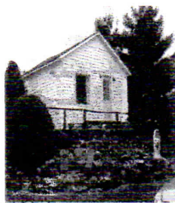
St Joseph's Retreat House