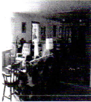
Living Room Main House